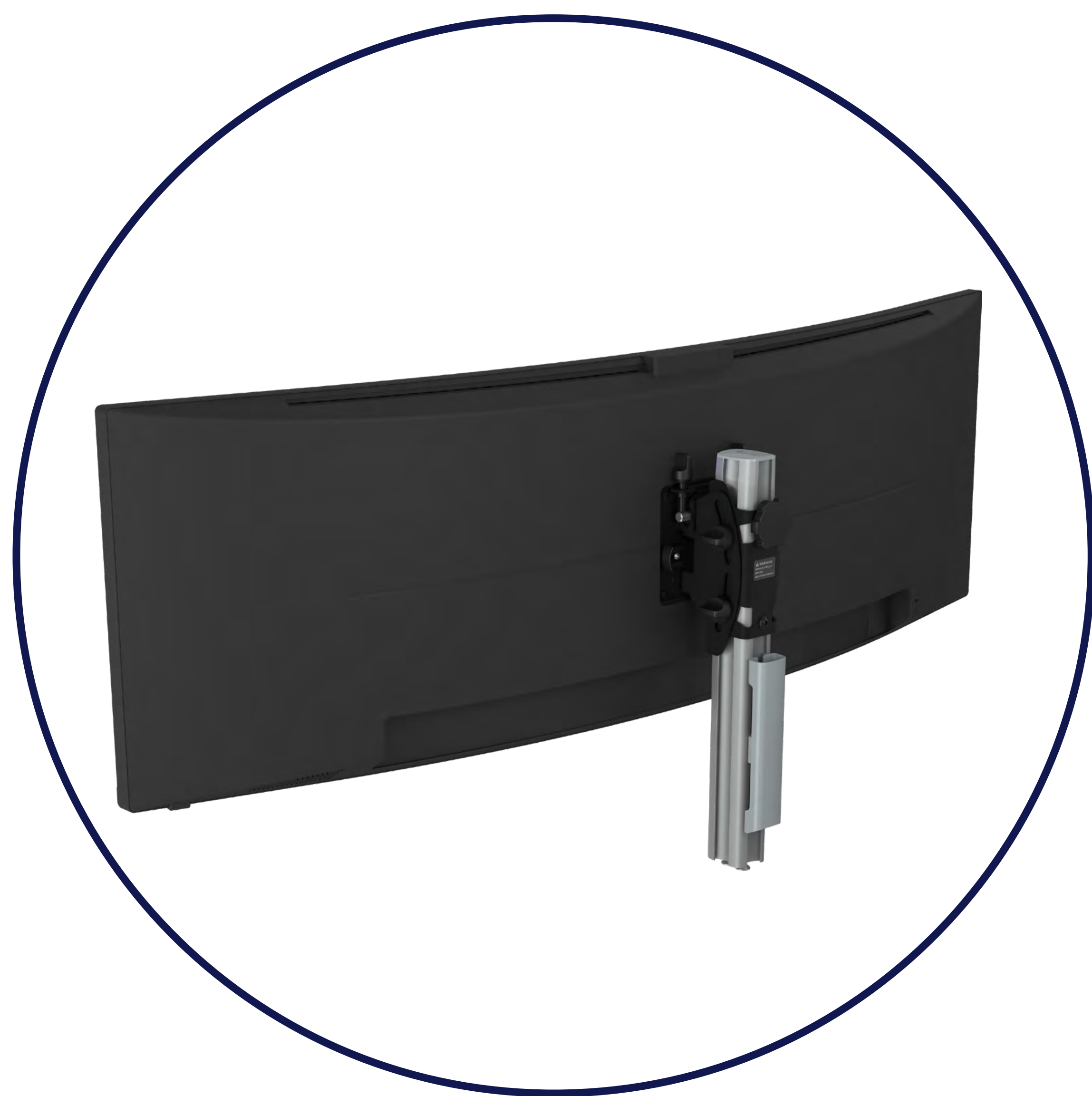
AWMS-BT40 Single ultrawide

For monitors to 55" each weighing 18kg (curved) or 25kg (flat) CAN HOLD TWO ODYSSEY NEO G9s